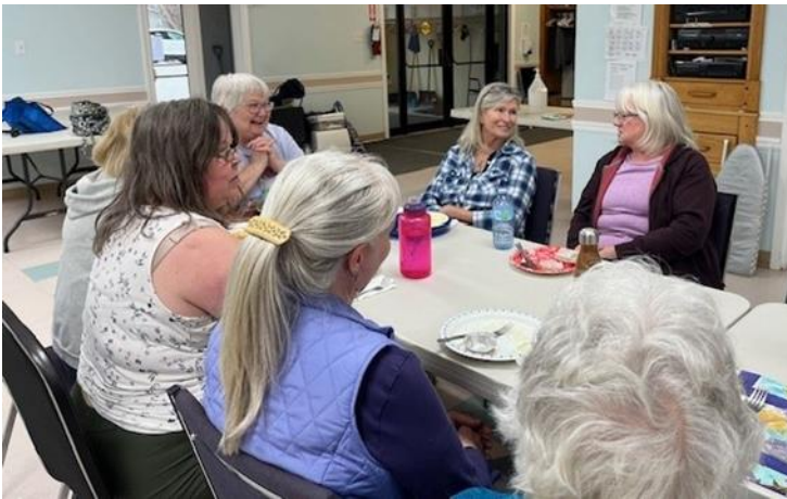
1 day retreat @ the Seniors Centre April 20