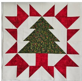
November—Pine Tree Pillow Leah Mitchel