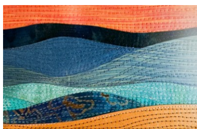
March Improved Curved Piecing Barb Redford