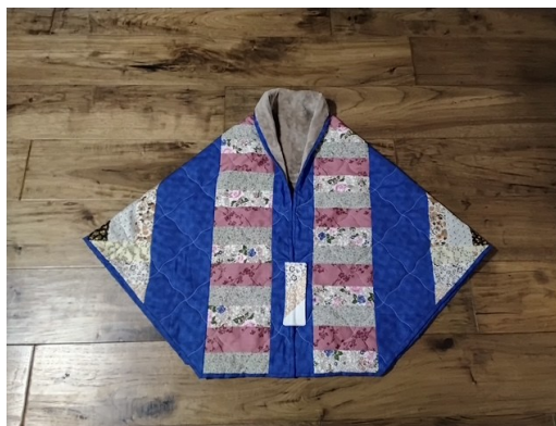
Quilted hug made with my husband's grandmother's blocks